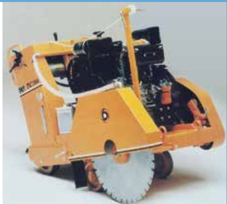
Floor saw machine