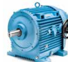
17 (15 kW) 17B (22 kW)