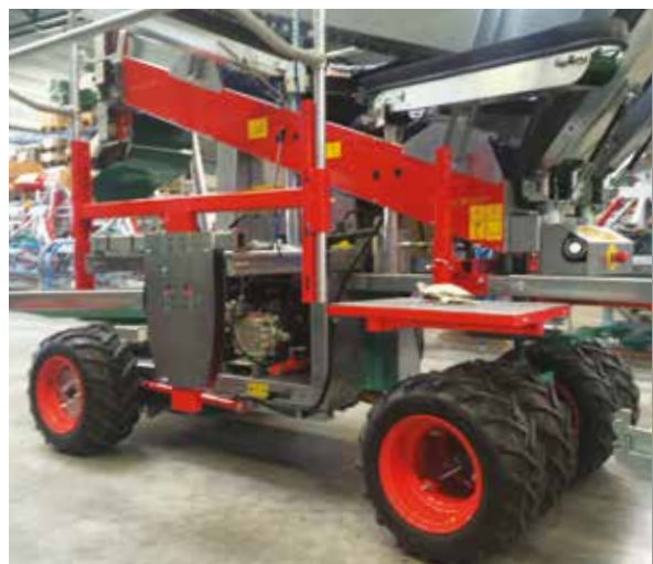
Harvesting fruit machine