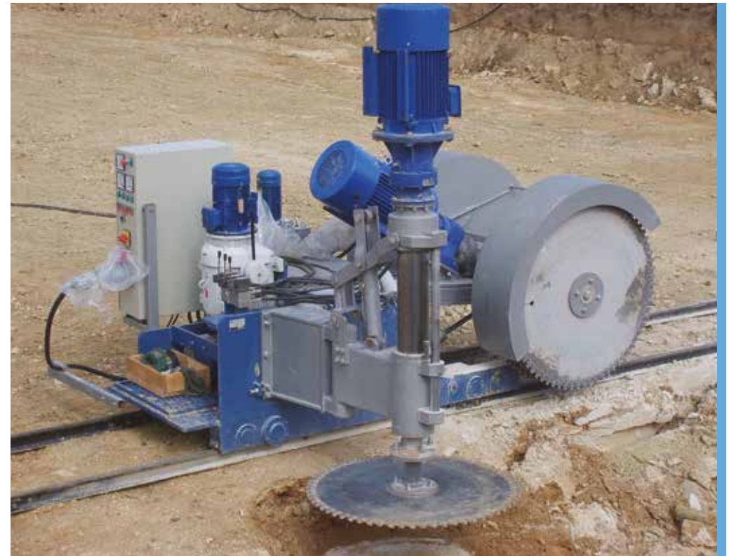
Quarries cutting machine