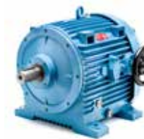
16 (5,5-7,5 kW) 16B (11 kW)