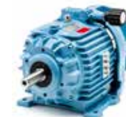
K5 (2,2-3-4 kW)