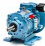
K2 (0,37-0,55-0,75 kW)