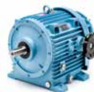
15 (3-4 kW)