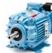
K4 (1,1-1,5 kW)